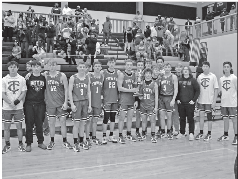
The Towns County men following their second-place finish at last week's Region 8-A Public Tournament in Commerce. The Indians will open the State Tournament on Wednesday when they host the 18-8 Bowdon Red Devils from Region 6-A.