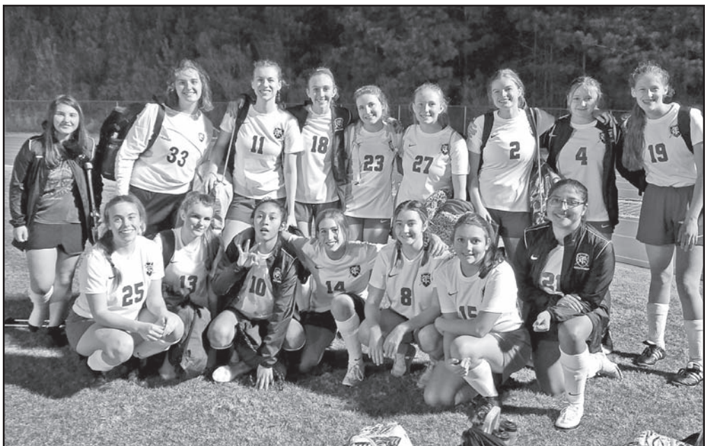
The Lady Indians celebrate their 3-2 win over Lincoln County on Feb. 15.

Visit www.townscountyathletics.com to keep updated on all the upcoming sports schedules.